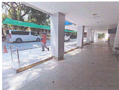
Figure 2 Plaster finishing for columns and sidewalk along the lobby