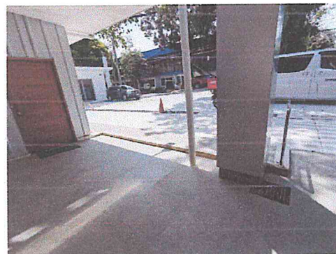
Figure 3 Plaster finishing for columns and sidewalk along the lobby