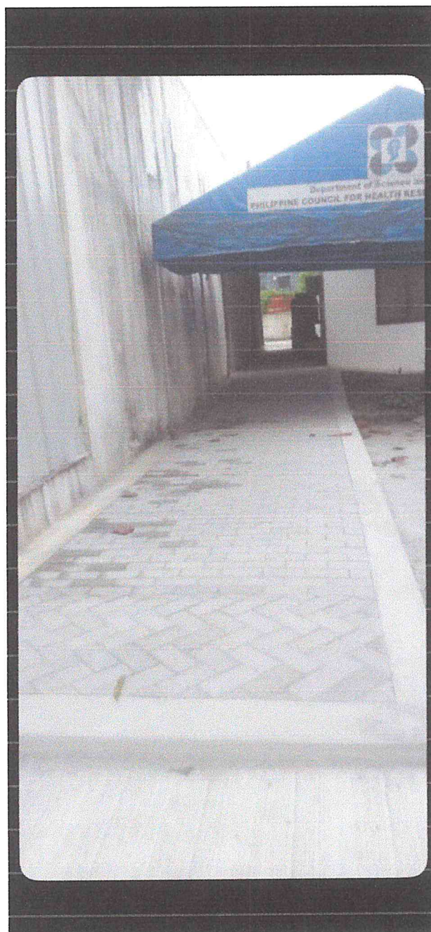
Figure 4 Provision of above side walk (RDMD Extension Office)