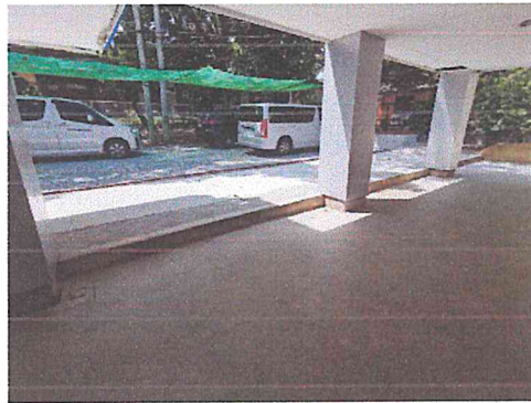
Figure 1 Plaster finishing for columns and sidewalk along the lobby