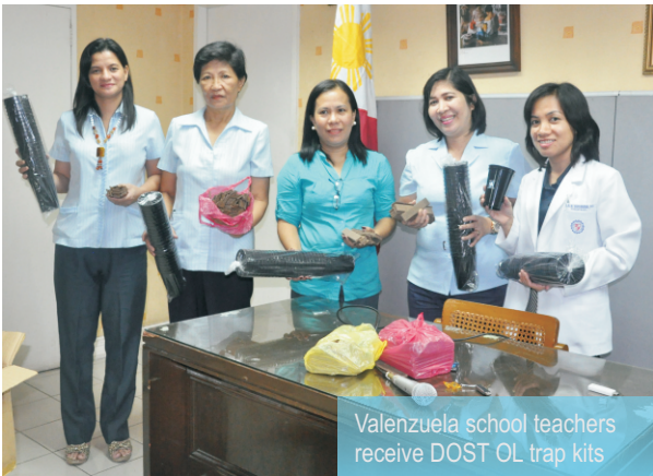
Valenzuela school teachers receive DOST OL trap kits

Specific targeting is the immediate response of the authorities to conduct control measures in a particular community whenever suspected dengue cases are reported. “What we added here is the use of short messaging system (SMS) or text that would allow real-time reporting of dengue cases,” said Secretary Ona.